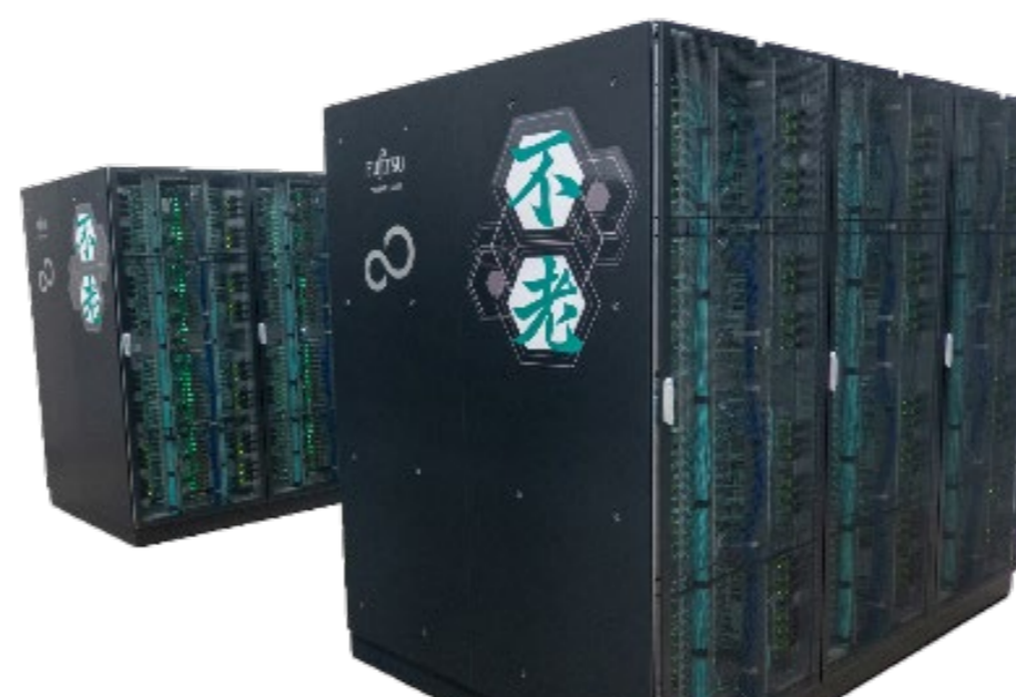
Type I subsystem 7.8Pflops