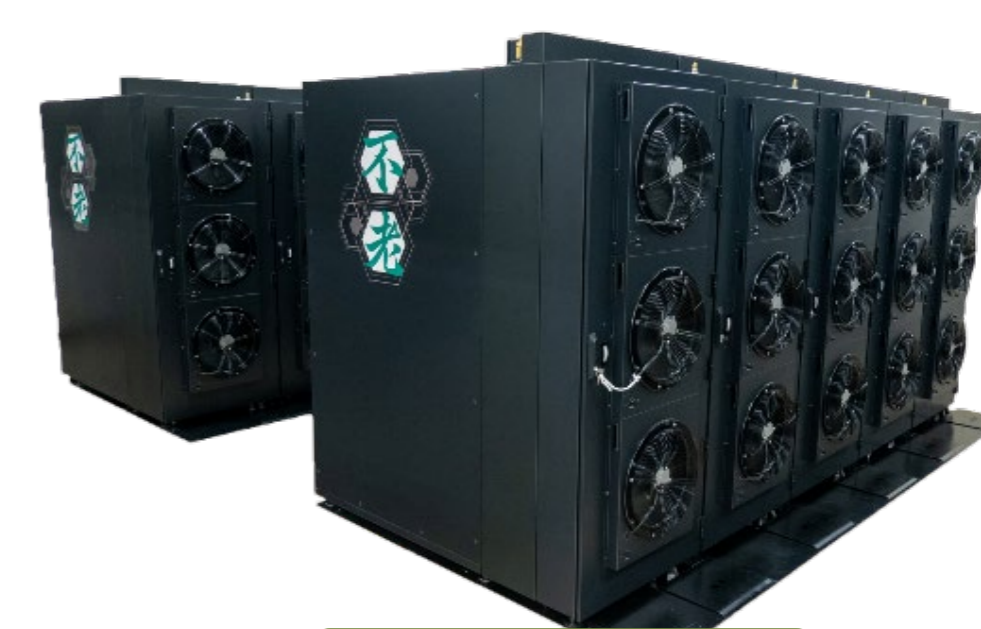
Type II subsystem 7.5Pflops